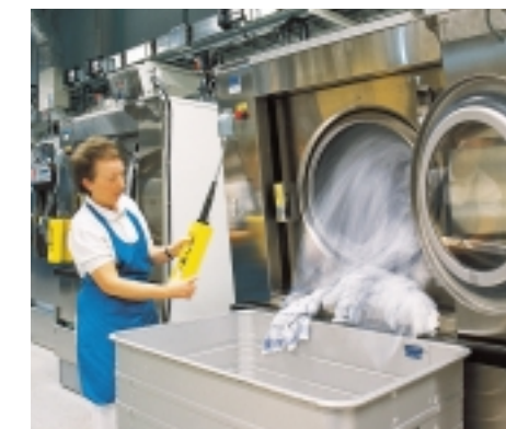
Wascomat EX6200 washer model with optional forward and backward tilting and big door for easy loading and unloading.