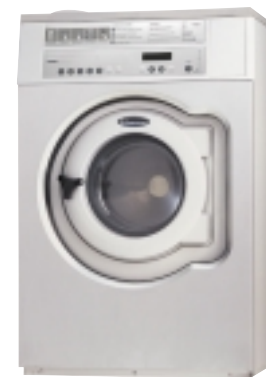
EX625s: 25 lb. cap. Up to 350 G-Force

Restaurants Health/Athletic Clubs Shirt Laundries Drycleaners