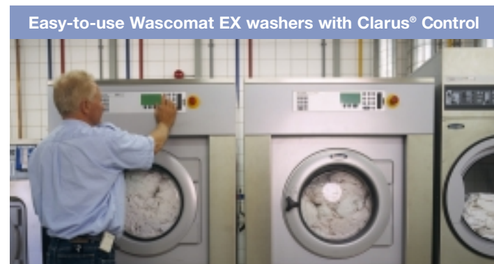
Easy-to-use Wascomat EX washers with Clarus® Control

Refer installation and servicing to qualified personnel. Always consult local codes before installation. Protect machines with properly rated, inverse-time, common-trip, industrial-type circuit breakers ONLY. Contact Wascomat for more information and for availability of machines for electric services not listed. Specifications subject to change without notice. Wascomat assumes no responsibility for errors or omissions in this information. Consult a qualified engineer to determine suitability for other than ground floor installations.