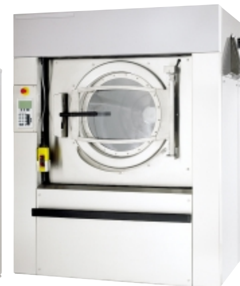
EX6250c: 250 lb. cap. Up to 300 G-Force